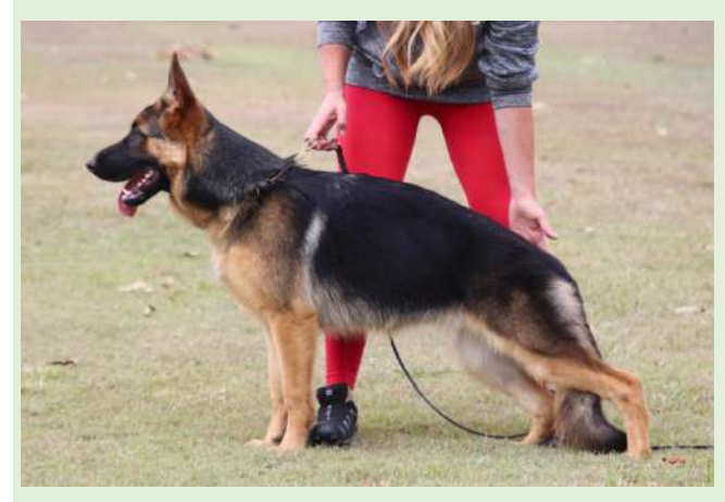
Minor SC Bitch VP1 INEFFABLE ESSENCE