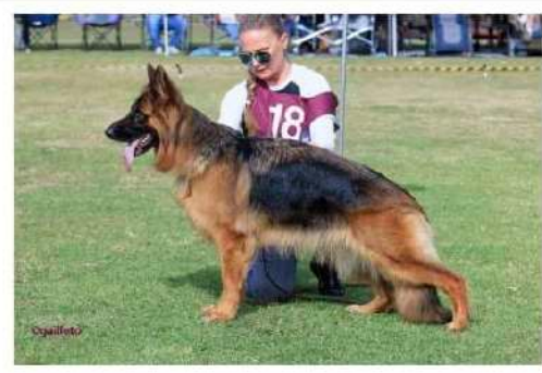
Ch. Cinderhof Chaanel Owners: R L TULLOCH