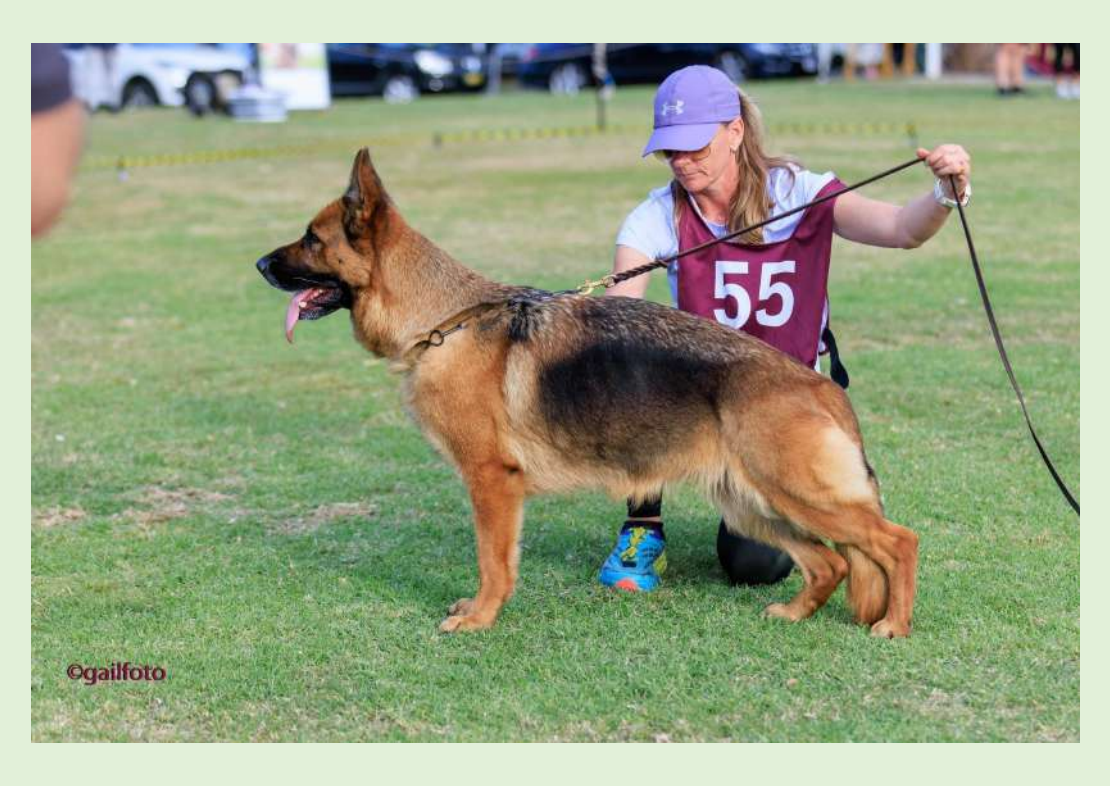
Best In Show 2<sup>nd</sup> Ch. Eroica Ice Ice Baby