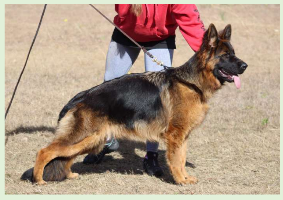
VP1 GABMALU LIBERTE