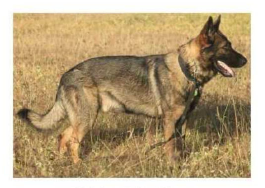
Boldsteps Krackle Owners: T GLEESON