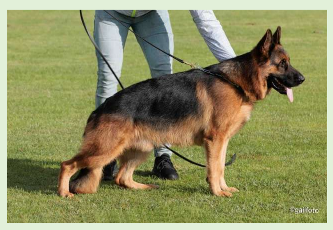
Best In Show 2<sup>nd</sup> Ch. Eroica Ice Ice Baby