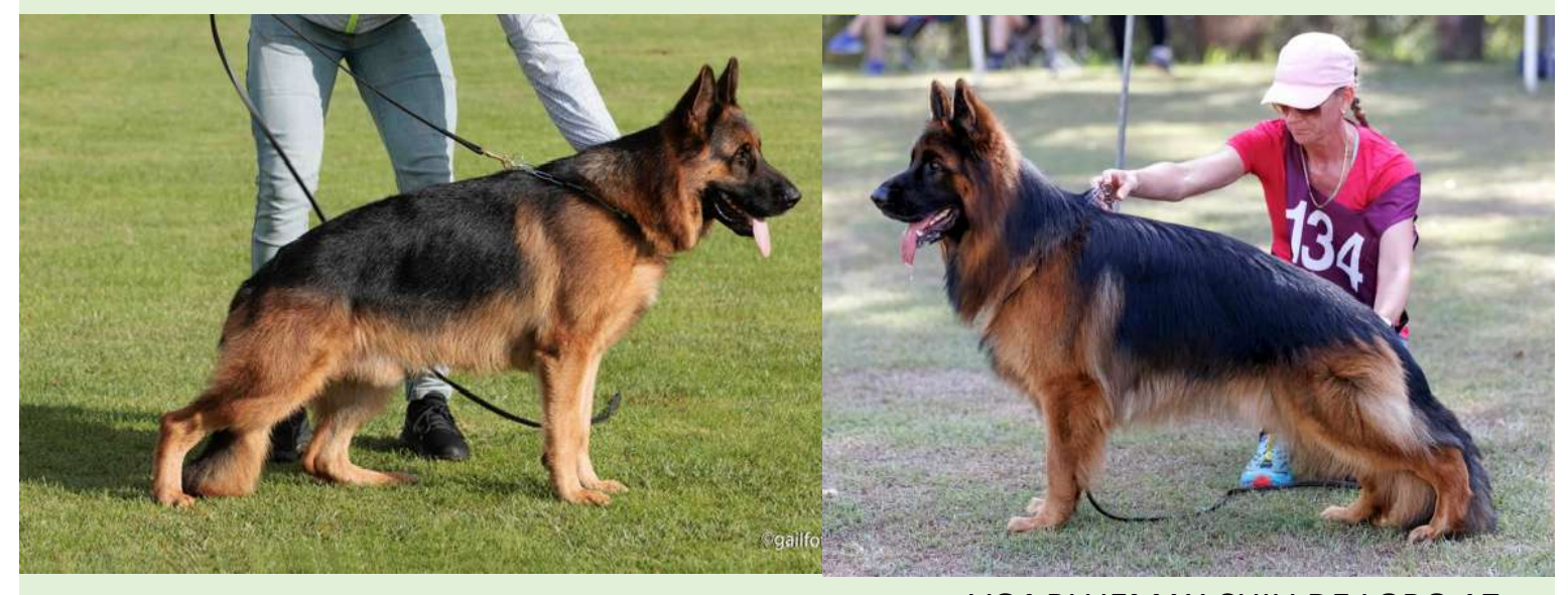
VG4 BLUEMAX CHILI DE LOBO AZ