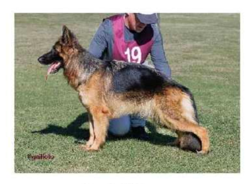
Panskyli Finesse Owners: S & B HURLEY