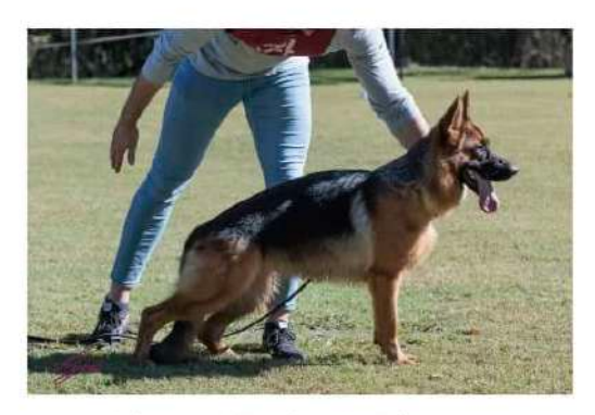
Bluemax Hazelnut Swirl Owners: A F BRINKWORTH