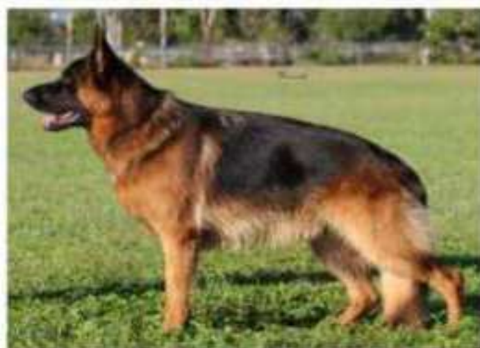
SHEPROSE WHAT A PERFORMER