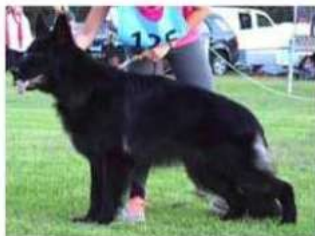
LETTLAND FLINT Sire: WUNDERSTERN ELMEZZI Dam: LETTLAND ALTHEA BRIGHT SKY Owner/s: B & D HOUGHTON