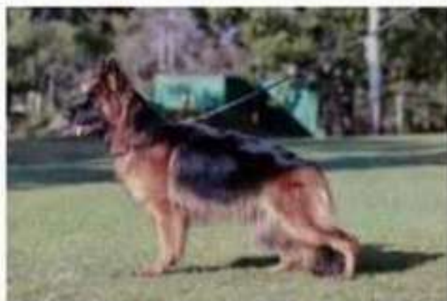
LETTLAND EPIC EDITION Sire: EROICA ICE ICE BABY Dam: BEAUTRAE EXTREME ENVY Owner/s: B & D HOUGHTON