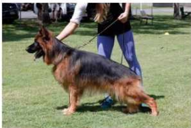
LAWINE RED BARON

SIRE: DJAMBO VOM FICHTENSCHLAG (IMP DEU)