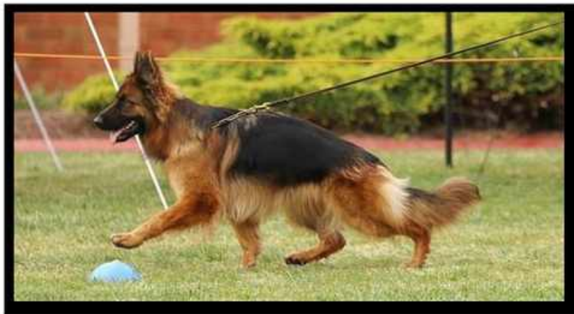
CH.*Jaknell Ruby Tuesday AZ

On a daily basis I work with breeders and exhibitors worldwide in my role as Director of Sires On Ice, a Canine Semen Reproduction and Semen Transport Company.