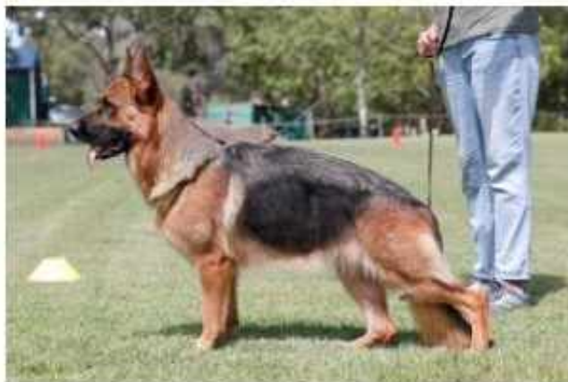
BLUEMAX SALTED PEANUT