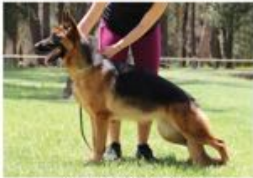
KELINPARK ROCKY ROAD

SIRE: CONBHAIREAN KARLOS DAM: ASTASIA GAMBA Owner's: A DRINKWATER