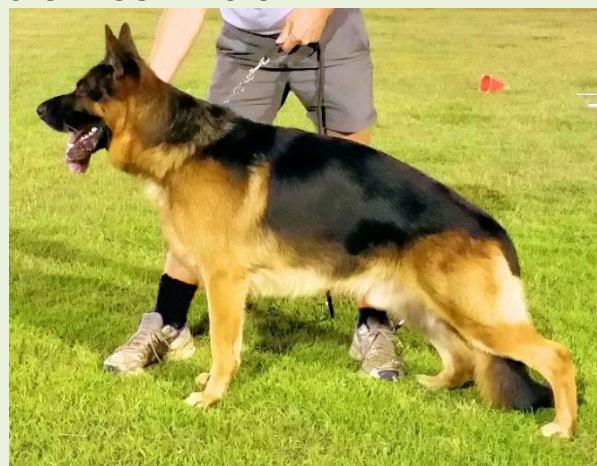
*Leishjaclyn God Dancer AZ