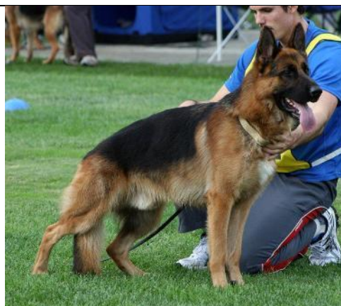
VICE SIEGER – *CH. ASTASIA ELI CD ET HIT A Z