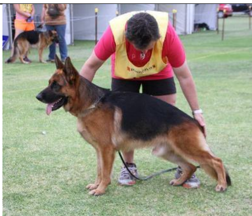
SIEGER – *CH. BLUEMAX SALT A Z